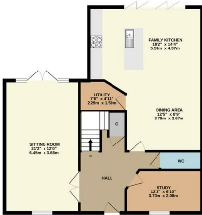
GROUND FLOOR 883 sq.ft. (82.1 sq.m.) approx.